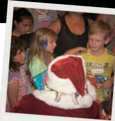
Kid's Christmas Party