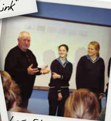
Les Educates at Regional School