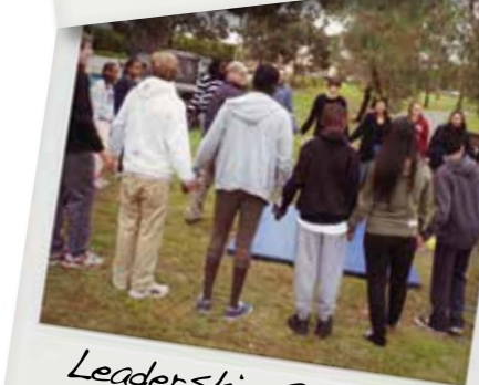
Leadership Program Induction