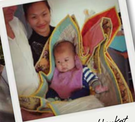
Bub gets a blanket