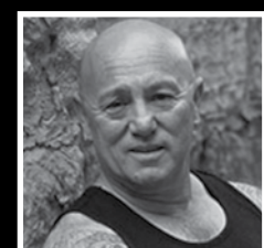
Angry Anderson - Patron