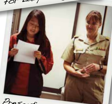
Presenting to Australian Defence Force