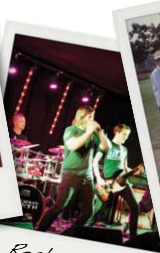
Rock 4 Charity