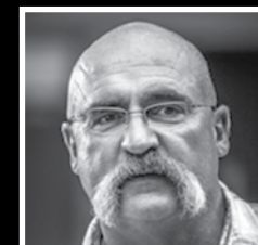
Merv Hughes - Ambassador Cricket