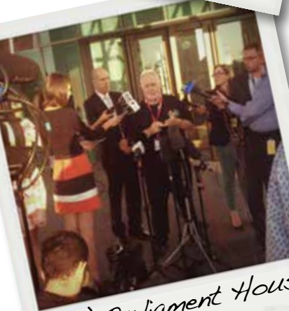
Les' Parliament House Press Conferen