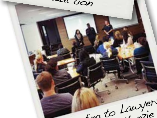
Presenting to Lawyers @ Baker McKenzie