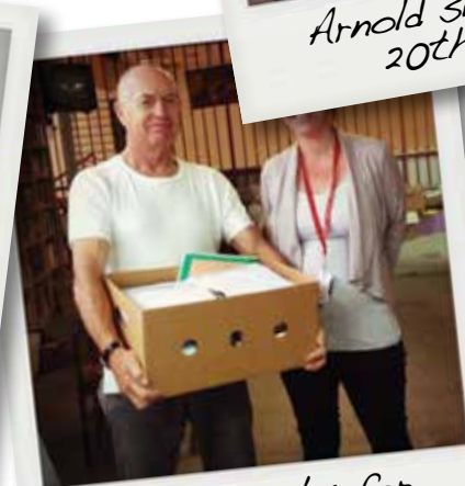
More Books for "Back to School"