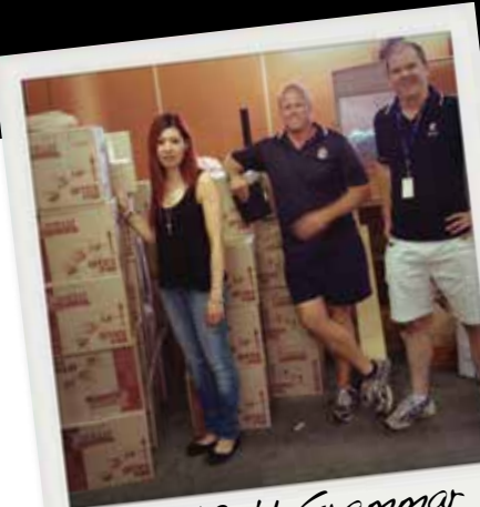
Caulfield Grammar Donate School Books