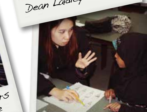
Math Tutoring @ Saturday School