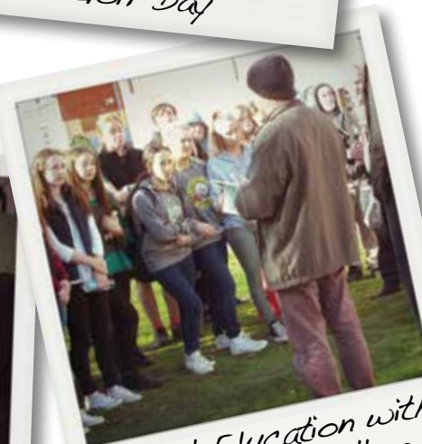
Social Education with Damascus College