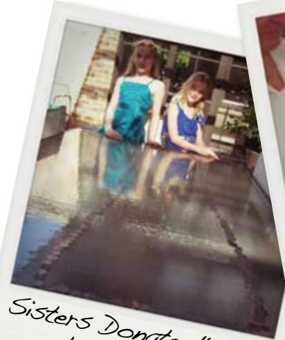
Sisters Donate $33.70 to 20th Man