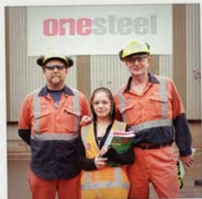
One Steel - Workplace Giving