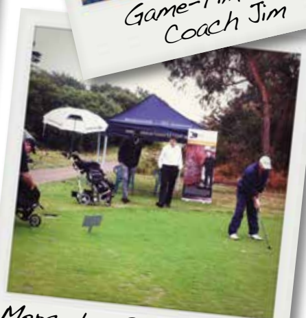
Mercedes Benz Brighton Golf Day