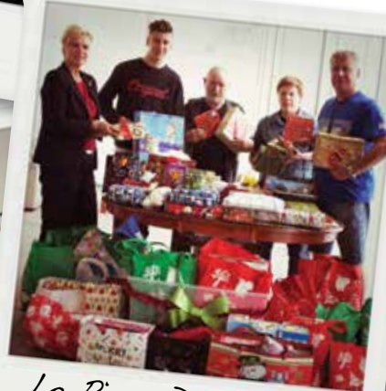
Le Pines Donate for Christmas