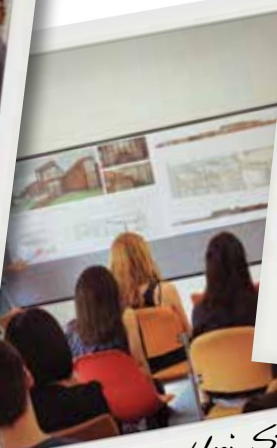
Melbourne Uni Students Present "The Link"