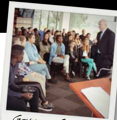
Governor General & Leadership Group