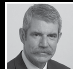
Greg Davies - Patron