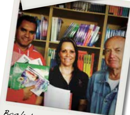
Back to School Program